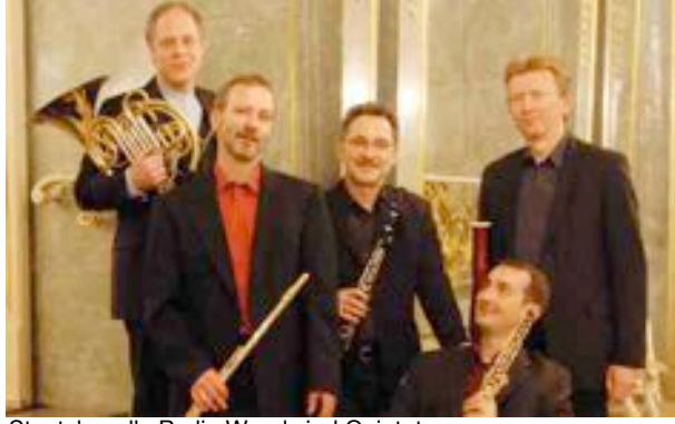
Staatskapelle Berlin Woodwind Quintet