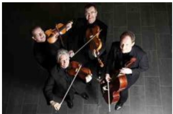
RTÉ Vanbrugh Quartet