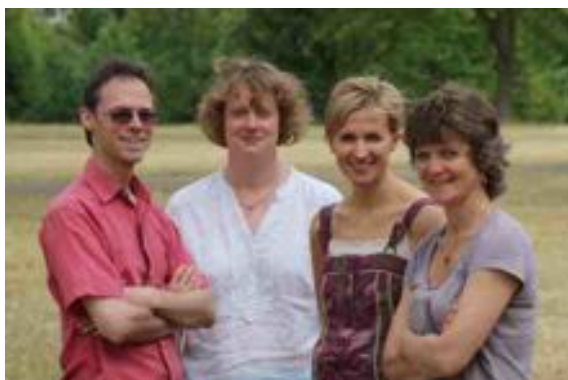
Revolutionary Drawing Room