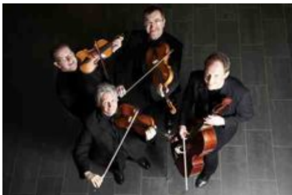
RTÉ Vanbrugh Quartet